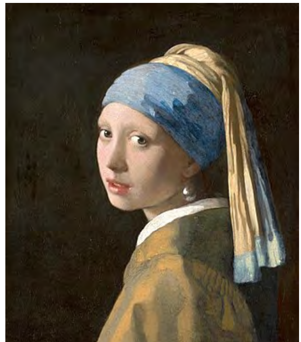
Girl with the Pearl Earring (1665) by Johannes Vermeer

An excellent example of this technique is the famous painting, Girl with the Pearl Earring , by the Dutch painter Johannes Vermeer, which was painted in 1665. The sunlit edge of the girl's face is in stark contrast with the dark background, which leads the view's eyes to her eyes, which are the focal point.