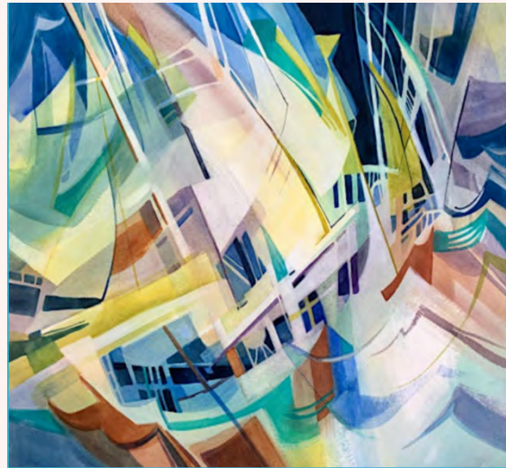
Art by Kathleen Conover

Every first Friday of the month in Ishpeming 5:30-8:00. Connect to the Ishpeming First Friday Art Walk Facebook Page if you are interested in displaying your work.