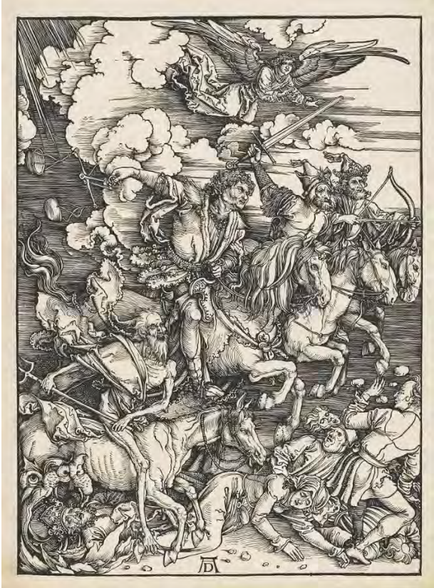
The Four Horsemen of the Apocalypse (1498) by Albrecht Dürer, Public domain, via Wikimedia Commons

The use of line in printmaking to create value is a centuries-old technique. This print by Albrecht Dürer, German painter, printmaker, and theorist of the German Renaissance was made in 1498. He used woodcut blocks and copper engraving to make prints. His use of line gives figures a three-dimensional look and adds contrast of light and dark values to highlight the action depicted in this print.