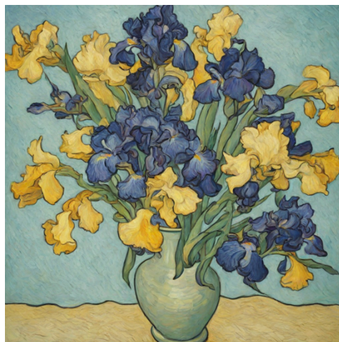
The A.I. Artist starts to arrange the pixels in various shapes. It might take many tries to get something acceptable.