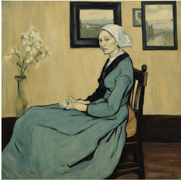
Here is the A.I. output. You can see how the background, color palette, and brush work are derived from van Gogh's Irises, but how the pose and background elements echo Whistler's portrait.

It is not the methodology of a human art forger; the A.I. has instead learned to be something like an apprentice in Rembrandt's workshop.