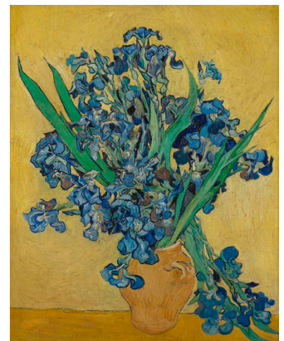
The Critic encourages the A.I. artist to keep producing images until one is close in style to an actual van Gogh painting